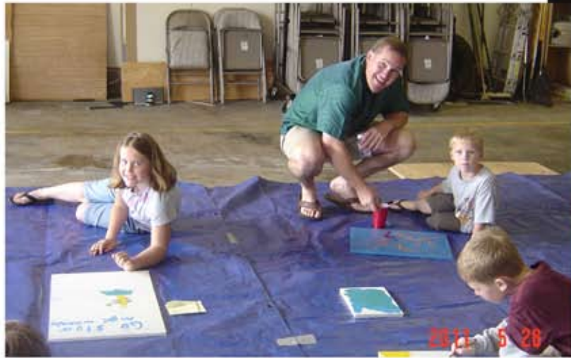
The Ingle Family supervises sign painting