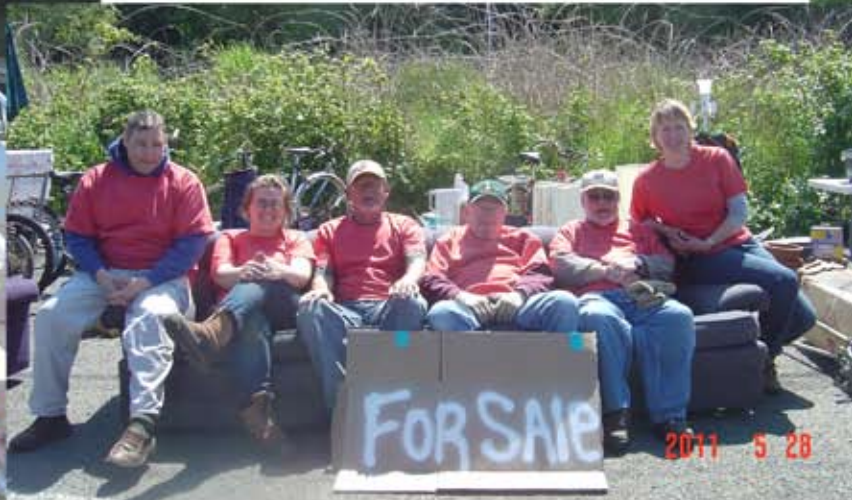
Trash & Treasure Gang