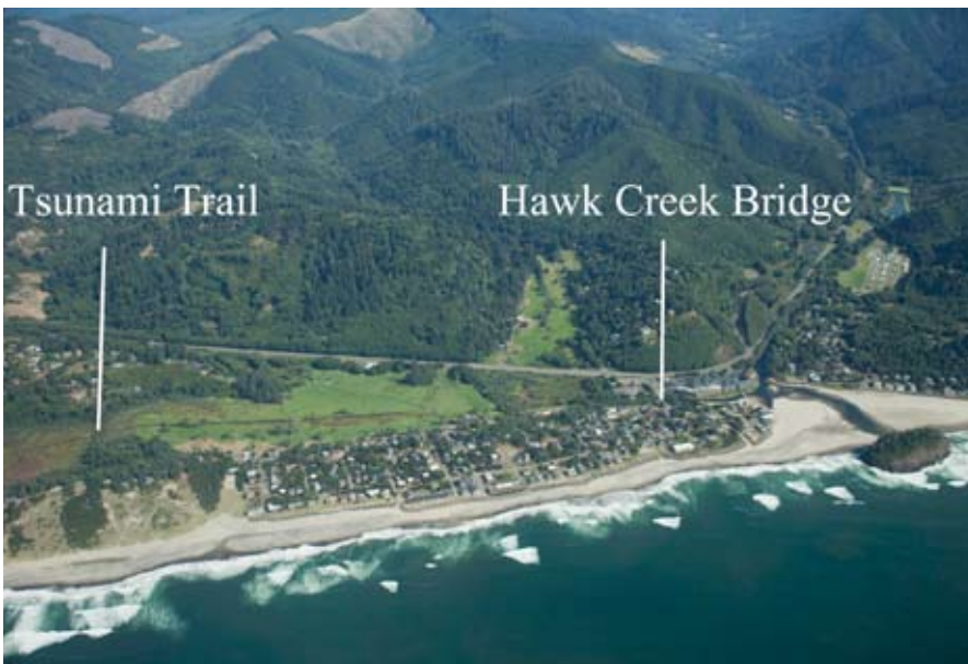
Neskowin Bridge and Trail