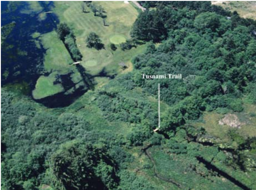
Trail Crossing

Get your team of 4 ready for this year’s scramble and be prepared to have some fun! Please see the sign-up sheet in this edition of the NCA newsletter and on the website. Reminder – 100% of the proceeds from the golf scramble benefit the Neskowin Community Association and are used to help make the community we all love even better!