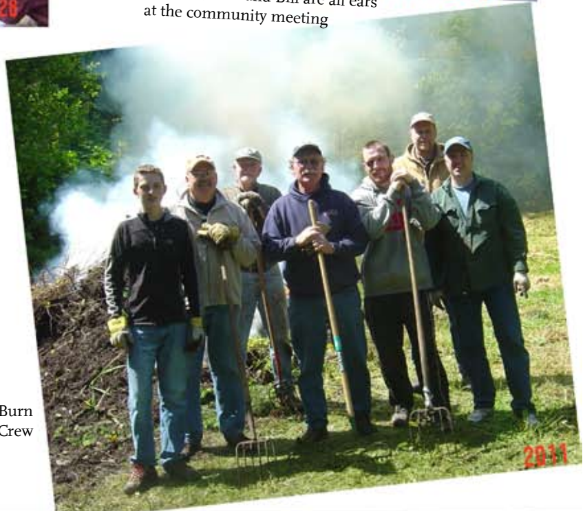
The Burn Pile Crew