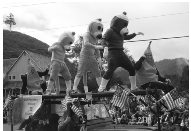
Monkeying Around at the 4th of July Parade