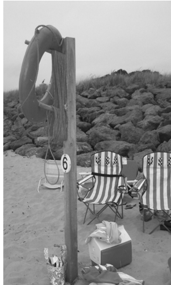
2010 Beach Cleanup