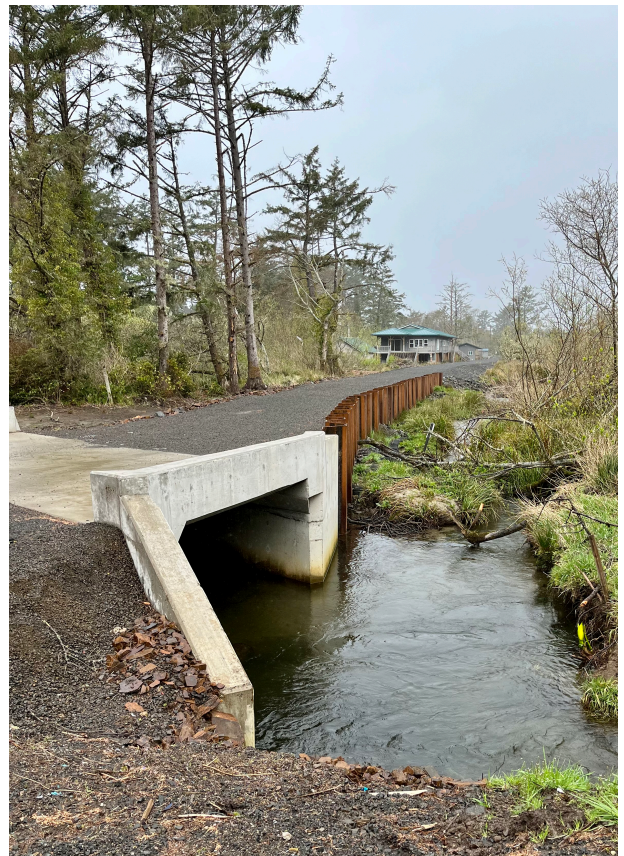
Egress Route: Southend looking north

Thanks to everyone who made this possible!!!