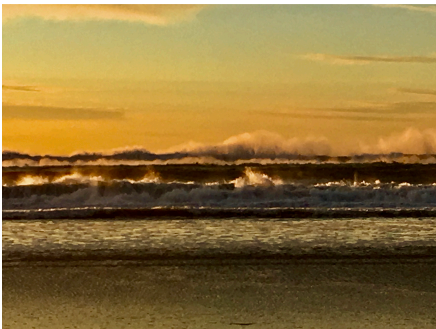
Afternoon winter storm surf, Neskowin