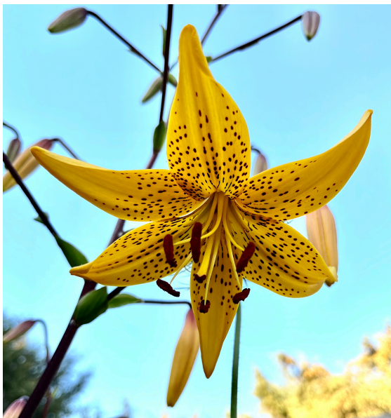
A lily from a Neskowin garden