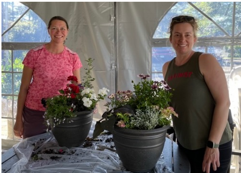
Participants in the Neskowin University's Container Planting workshop