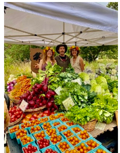
Corvus Landing Market Crew 2022

Beverages include wine and spirits, grown and aged in Oregon and coffee roasted on the coast. A rotating schedule of talented, local artisans will offer ceramics, hand woven rugs, crocheted dolls, animals and baskets, jewelry and leather goods, among other works of art. Hot and cold prepared foods will be there to purchase for your picnic lunch on the beach or at the market while you enjoy the live music performed by talented musicians. The rotating Community Booth will provide information about the work, events and outreach of organizations in our neighborhood. Please visit our website, neskowinfarmersmarket.com for a complete list of our vendors and schedule. Are you interested in volunteering at the market? Email Rachel and Jake at neskowinfarmersmarket@gmail.com . See you at the market on Saturdays between 9am and 1pm!