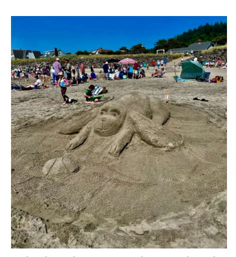
The beach was very busy July 4th with the Sandcastle Competition and Kite Flying.