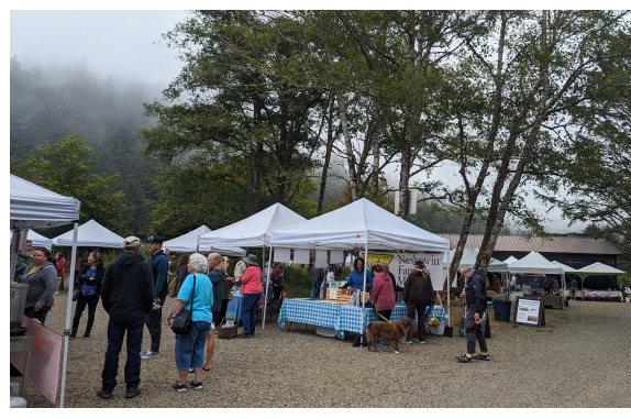
Neskowin Farmers Market is located east of Hwy 101 each Saturday from 9-1.

It's been another great season for the Neskowin Farmers Market! Hundreds of shoppers every week continue to support local farms, food producers, artisans, artists, musicians and community organizations. A successful farmers market may seem like just a marketplace for simple purchases - a few groceries for tonight's dinner, a snack before heading on to the next stop, a gift for a friend - but the benefits ripple throughout a small community like ours in intangible ways as well: relationships built over months and years of small interactions, a place to feel welcome and included, lifelong memories of a trip to the coast.