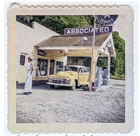
From the 1930s through the 1940s Neskowin had its own gas station across the highway from the store.