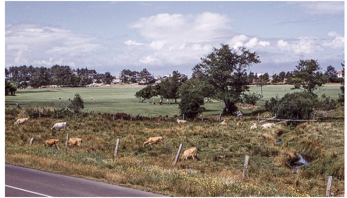
Dairy cows grazed between Highway 101 and the 8th fairway of Neskowin Beach Golf Course in 1957.

NBGC looks forward to seeing you all this season.