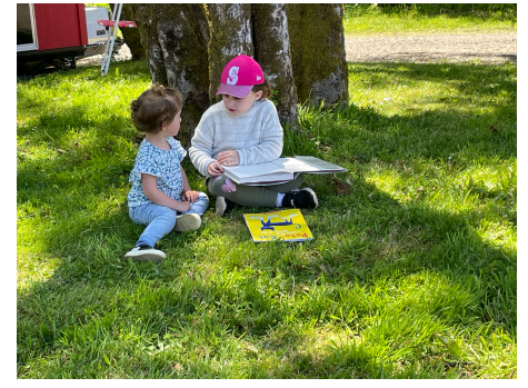
One child shares a book with another when the Celebration of Language Program gave books away at Neskowin's Farmers Market

Grant program guidelines are posted at the NCA's website.