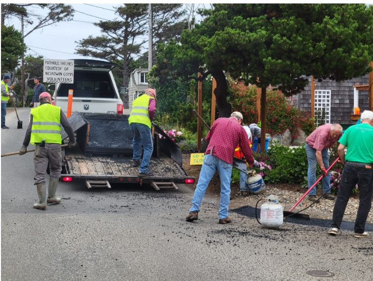
The Midnight Pavers improve the corner at Breakers and McMinnville Ave.

If you're interested in getting involved with this year's Market, please contact us at neskowinfarmersmarket@gmail.com . We have many volunteer opportunities and potential opportunities for more musicians and fill-in vendors!